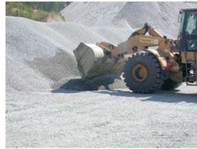
Step 3. Loader reaches across the small pile, lowers bucket, and back-drags small pile to form the sampling pad