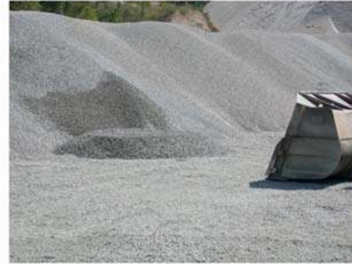
Step 4. Sampling pad