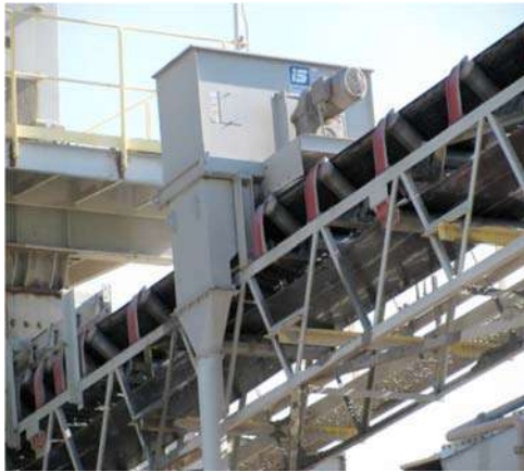
FIG. 2 Automatic Belt Sampler

acceptable for the particular situation. The sampling plan shall define the number of samples necessary to represent lots and sublots of specific sizes. The sampling plan shall also define any specialized site-specific sampling techniques or procedures that are required to ensure unbiased samples for existing conditions. The owner and supplier shall agree upon the use of any specialized site-specific techniques or procedures. When site-specific techniques or procedures are developed for sampling a stockpile, those procedures shall supersede the procedures given in 5.3.3.1. (Note 6). General principles for sampling from stockpiles are applicable to sampling from trucks, rail cars, barges, or other transportation units.