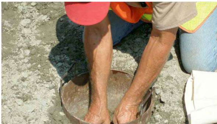
FIG. 5 Proper Use of Metal Template For Sampling Mixed Coarse and Fine Aggregate From Roadway Grade

NOTE 11—Guidance for determining the number of samples required to obtain the desired level of confidence in test results may be found in Test Method D2234/D2234M, Practice E105, Practice E122, and Practice E141.