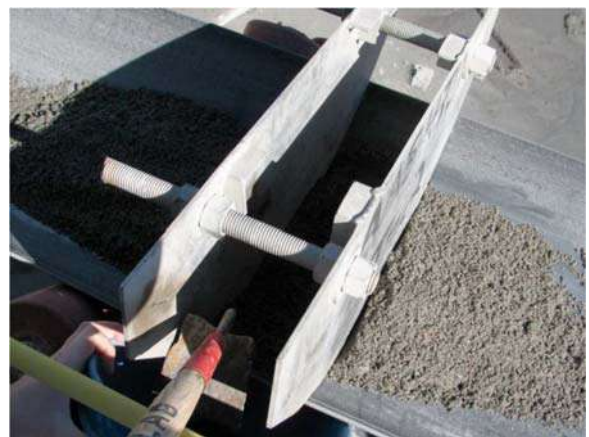
FIG. 1 Belt Sampling Template

5.3.3 Sampling from Stockpiles —Avoid sampling coarse aggregate or mixed coarse and fine aggregate from stockpiles whenever possible, particularly when the sampling is done for the purpose of determining aggregate properties that may be dependent upon the grading of the sample. If circumstances make it necessary to obtain samples from a stockpile of coarse aggregate or a stockpile of combined coarse and fine aggregate, design a sampling plan for the specific case under consideration to ensure that segregation does not introduce a bias in the results. This approach will allow the sampling agency to use a sampling plan that will give a confidence in results obtained therefrom that is agreed upon by all parties concerned to be