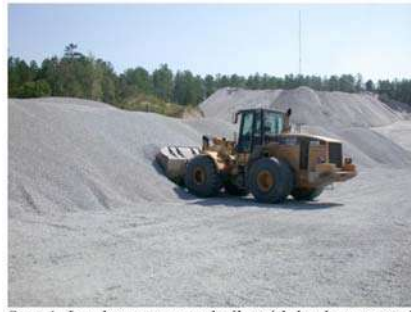
Step 1. Loader enters stockpile with bucket approximately 150mm [6 in.] above ground level