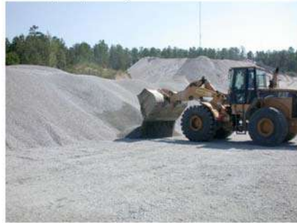
Step 2. Loader gently rolls the material out of the bucket to form a small pile